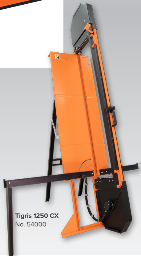
Tigris 1250 CX No. 54000