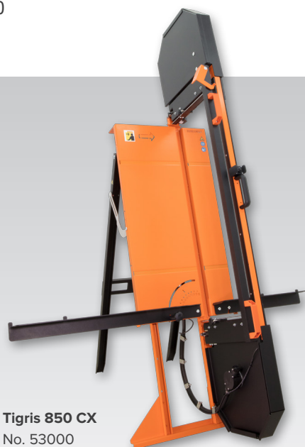
Tigris 850 CX No. 53000