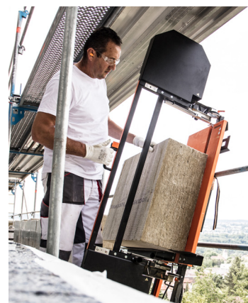
Tigris 850 CX – Optimal for working on scaffolding

3) For wood fiber insulation boards with a bulk density of up to 200 kg/m 3 and pressure resistance up to 200 kg.