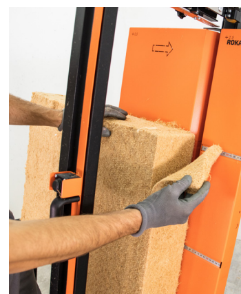
Also suitable for wood fiber insulation boards (with special accessories)