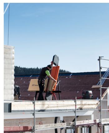
Tigris 1250 CX – Particularly suitable for roofers and carpenters