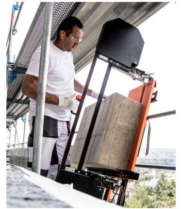
Easy to use